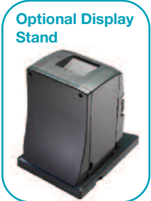
Optional Display Stand